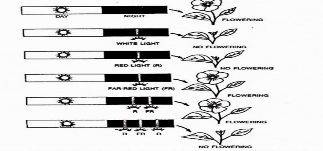
Fig. 5.3. Effect of night (dark) interruption on flowering in a short-day plant. vegetative but into flower bud.

From this observation, scientists concluded that what is critical or essential for these plants to flower is long and un-interrupted dark period rather than a short day length. A brief interruption of the dark period with light nullified the effect of long night. So to be more precise and appropriate, short day plants may be regarded as long-night plants.